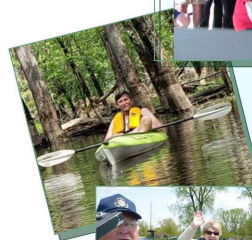
Picnics, Paddling and PFDs of Summer!

Thanks to the generosity of Dane County Parks, our annual picnic will be held at Token Creek County Park Shelter #2 Monday, August 22nd 4:00 pm—8:00 pm