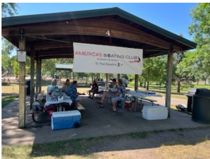
Annual Boater Appreciation picnic