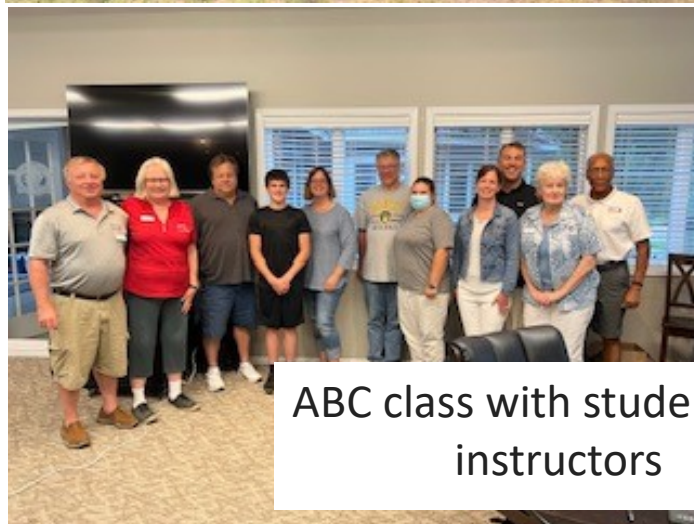
ABC class with students and instructors