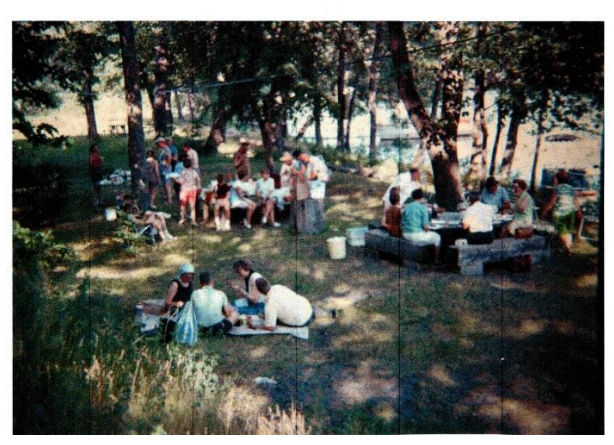
Streater Cove, early 60s