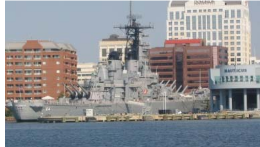
Battleship Wisconsin BB64