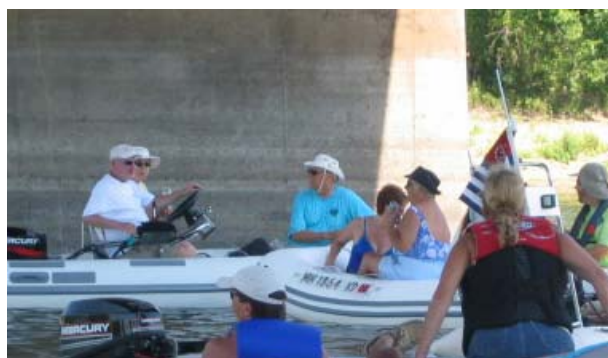
Dingy boat ride in Red Wing